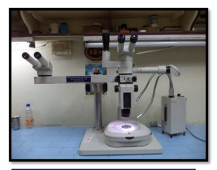
TRINOCULAR STEREOSCOPIC ZOOM MICROSCOPE