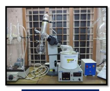
ROTARAY VACUUMFLASH EVAPORATOR