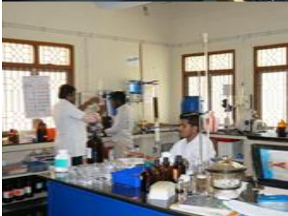
Instruments Lab - Marine Sciences