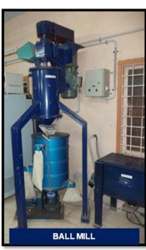
Instruments at Faculty of Agriculture